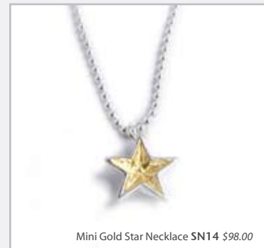
Mini Gold Star Necklace SN14 $98.00