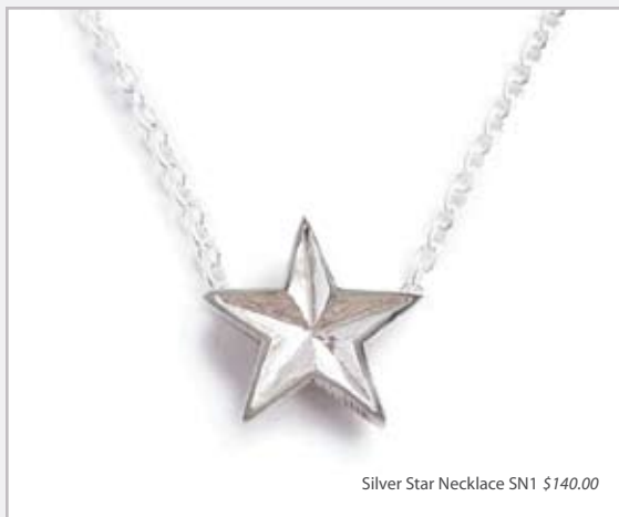
Silver Star Necklace SN1 $140.00