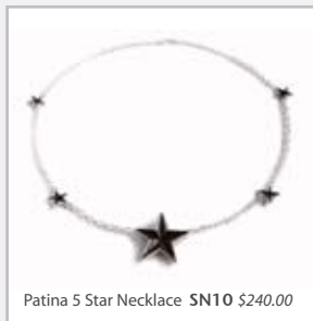
Patina 5 Star Necklace SN10 $240.00