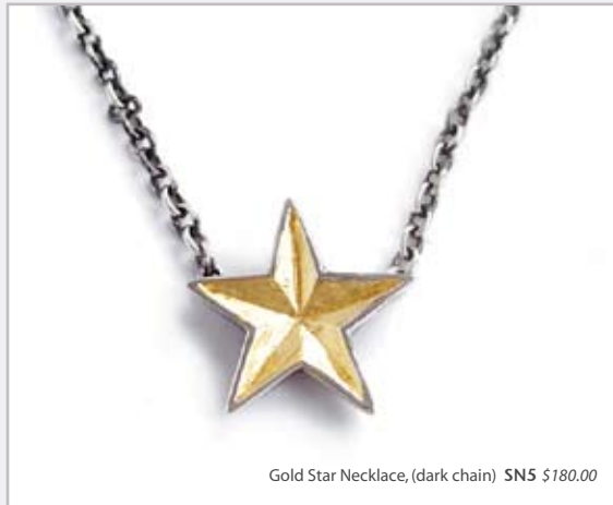
Gold Star Necklace, (dark chain) SN5 $180.00