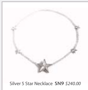
Silver 5 Star Necklace SN9 $240.00