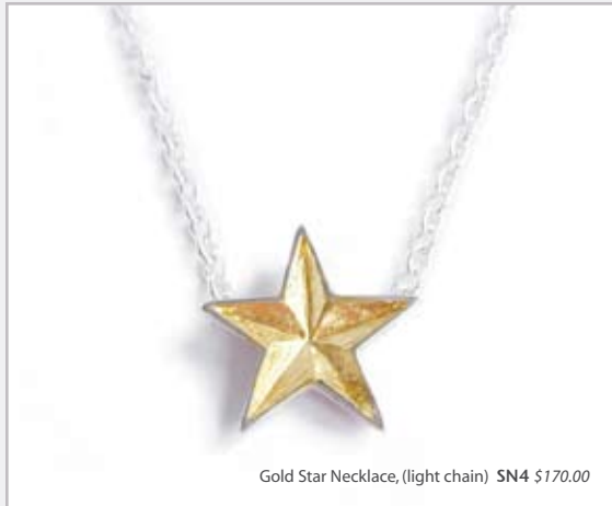
Gold Star Necklace, (light chain) SN4 $170.00