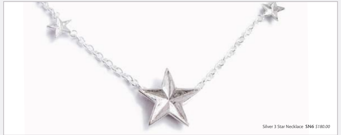
Silver 3 Star Necklace SN6 $180.00