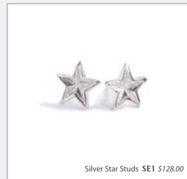
Silver Star Studs SE1 $128.00