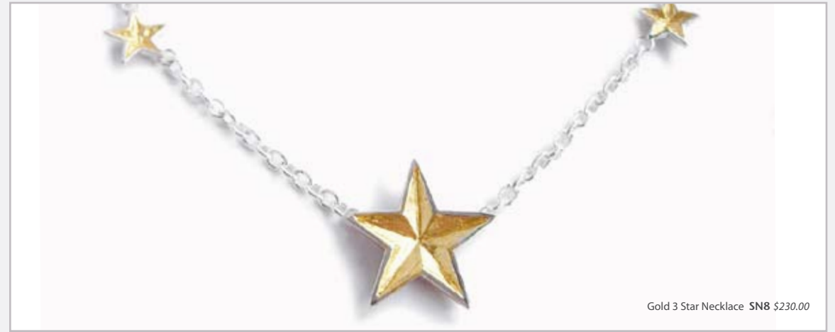
Gold 3 Star Necklace SN8 $230.00