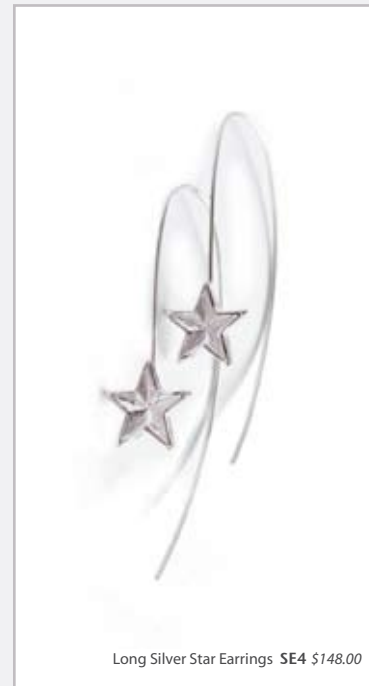
Long Silver Star Earrings SE4 $148.00