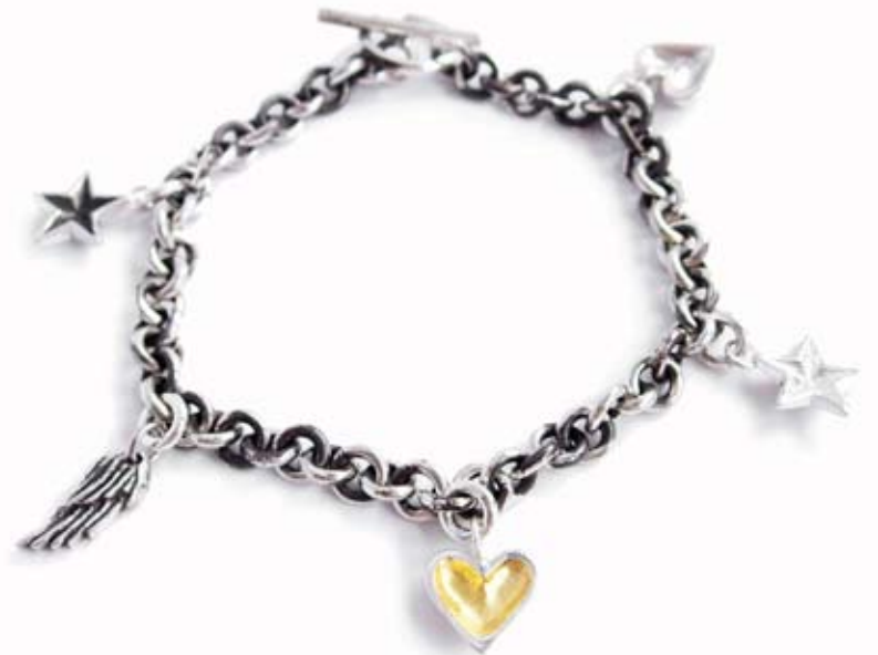
5 Charm Bracelet (dark chain) CHB2 $290.00