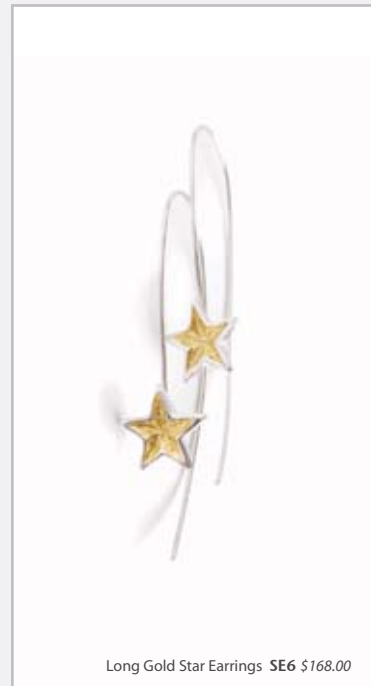
Long Gold Star Earrings SE6 $168.00