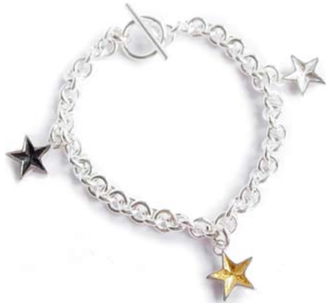
Star Charm Bracelet (light chain) SB1 $210.00