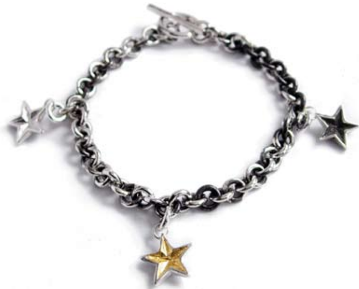
Star Charm Bracelet (dark chain) SB2 $210.00