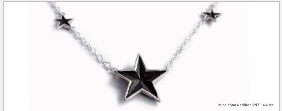
Patina 3 Star Necklace SN7 $180.00