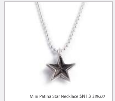
Mini Patina Star Necklace SN13 $89.00