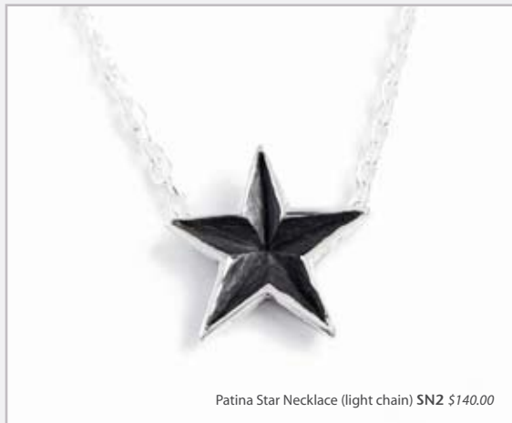
Patina Star Necklace (light chain) SN2 $140.00