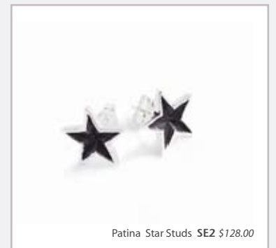
Patina Star Studs SE2 $128.00