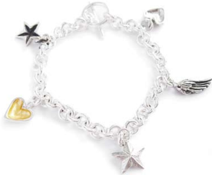
5 Charm Bracelet (light chain) CHB1 $290.00