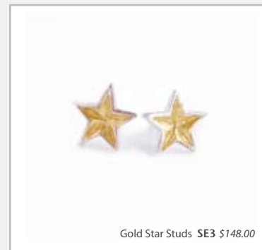
Gold Star Studs SE3 $148.00