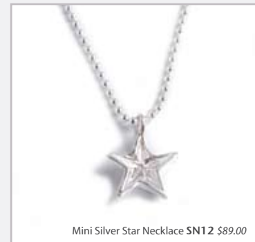
Mini Silver Star Necklace SN12 $89.00