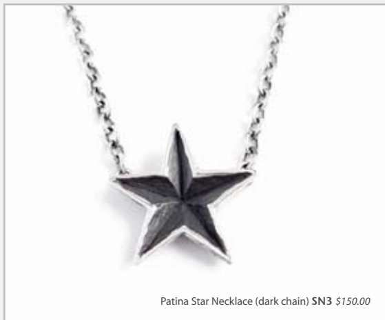
Patina Star Necklace (dark chain) SN3 $150.00