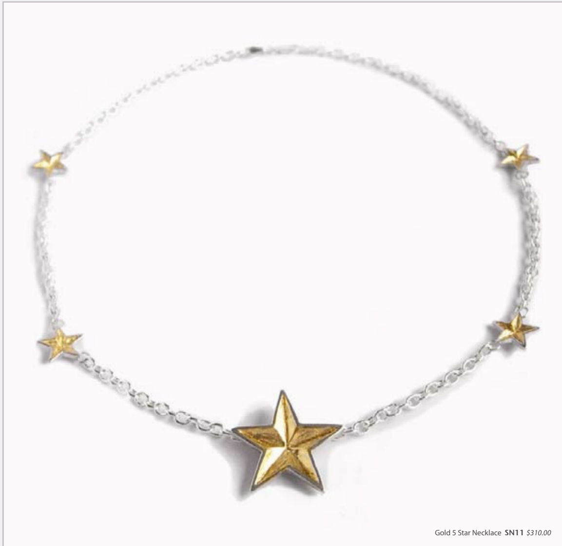
Gold 5 Star Necklace SN11 $310.00